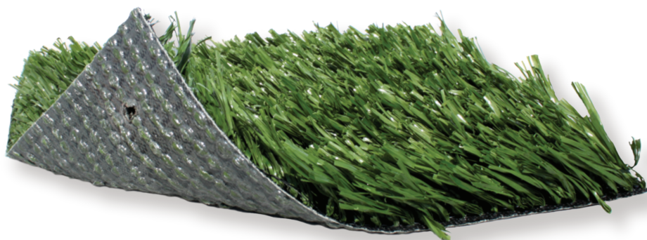
Standard Line and Field Colors*