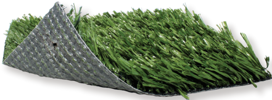
Standard Line and Field Colors*